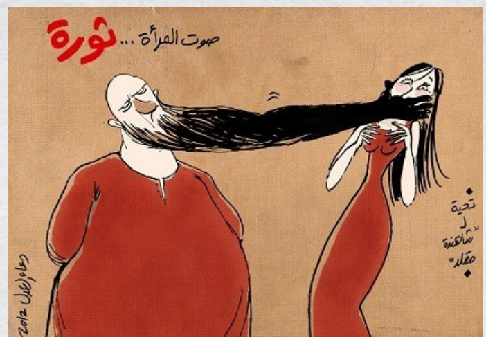
Egyptian female cartoonist pokes fun at fundamentalists.

Guest commentary is welcome. Please e-mail the editor at fitnah.movement@gmail.com .