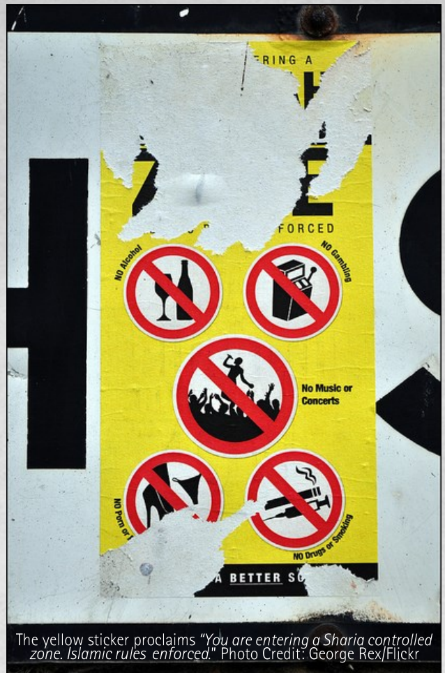
The yellow sticker proclaims "You are entering a Sharia controlled zone. Islamic rules enforced."

Conference sponsors include The Richard Dawkins Foundation for Reason and Science UK, Council of Ex-Muslims of Britain, Secularism is a Woman's Issue and Atheist Alliance International.