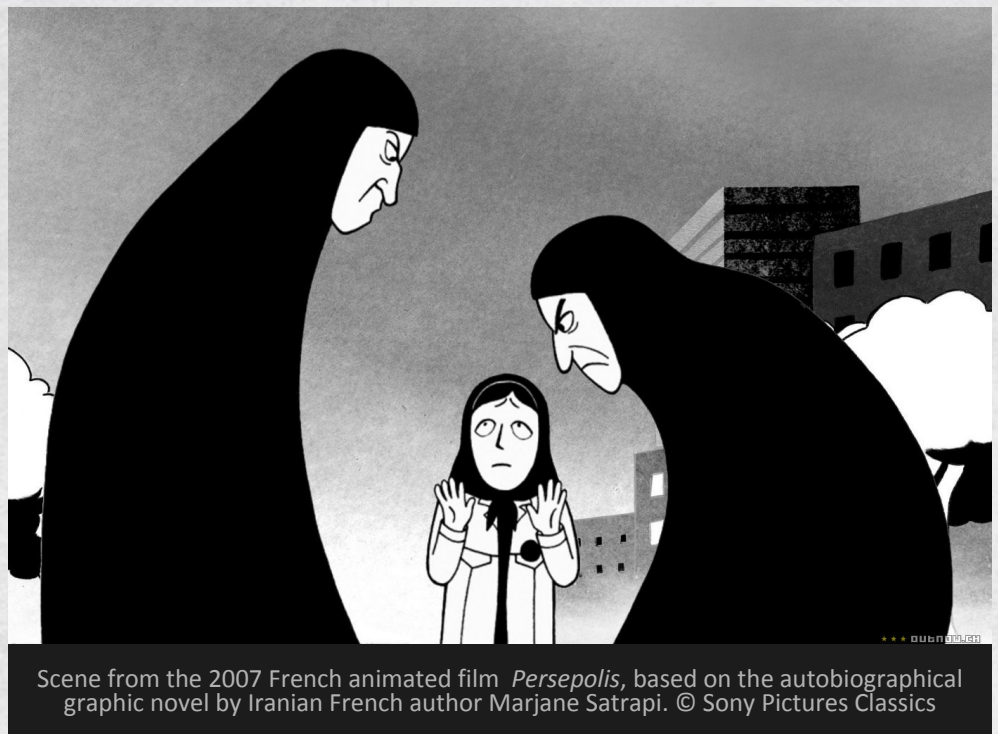
Scene from the 2007 French animated film Persepolis, based on the autobiographical graphic novel by Iranian French author Marjane Satrapi.