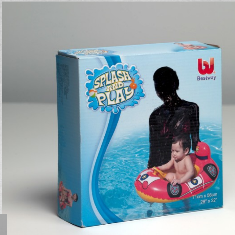
"Absent Portraits" - Pictures by Phil Toledano mrtoledano.com

Phillip Toledano has sourced censored packaging from Iran for his photography project ' Absent Portraits. ' He says: Packaging in which the women have been erased. Inked out, individually, by hand. I remove the blacked-out figure from the surrounding image, and a transformation occurs. The censor becomes an artist. And the censored figure becomes a portrait. A portrait not of a person, but of absence. Of suppression. A portrait of a point of view. The censor, whose job it is to erase, becomes the person who makes us look.'